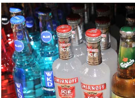
Figure 2 - Importance of roles in addressing underage drinking

However, 18% did consider under 18s drinking alcohol in public places a major problem in their area and a further 49% considered it a minor problem. Only 11% felt under 18s purchasing alcohol was a major problem in their local area, and a further 38% considered it a minor problem. The extent to which respondents felt both these issues were a major problem was highest in Banff and Buchan and lowest in Marr.